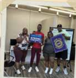
Our newly Organized MLK Center Members excited and ready to start negotiating their first contract.