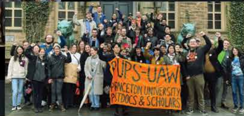
Princeton University Postdocs and Scholars Princeton, New Jersey