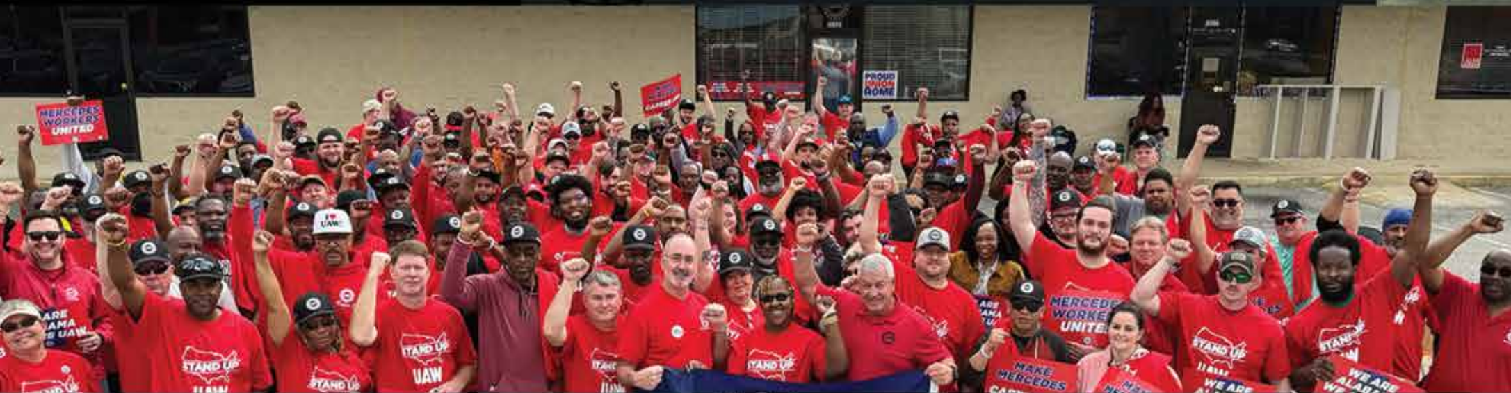
Mercedes-Benz Tuscaloosa, Alabama