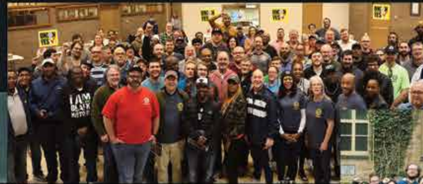
Volkswagen Chattanooga, Tennessee